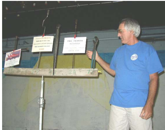
Video Vic show how to use a tire iron as a frequency control.

Entertainment: Fox Channel 11 video Toys for Big Boys.