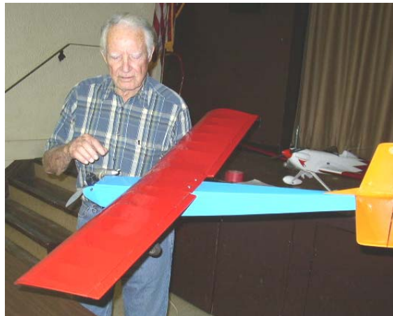
Gene showed an Air Cruiser powered by an OS .25 that had been crashed and rebuilt.