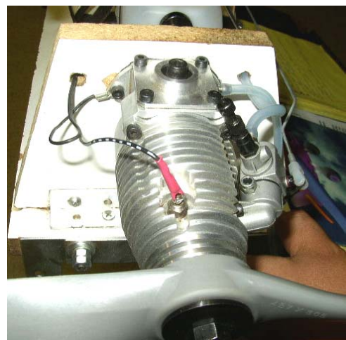
A close-up of the RCV Engine