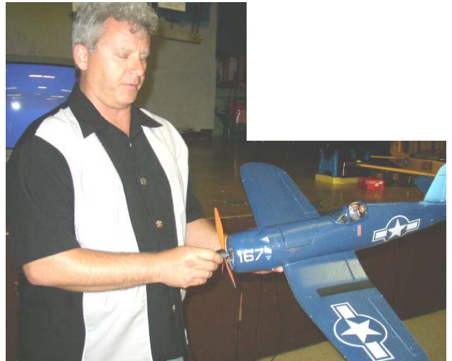
Chuck's GWS electric Corsair is very durable.