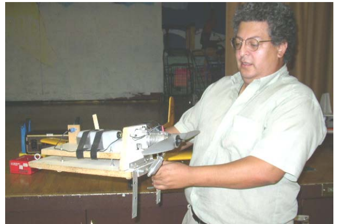
Scott's unusual RCV .90 4 stroke is from England.